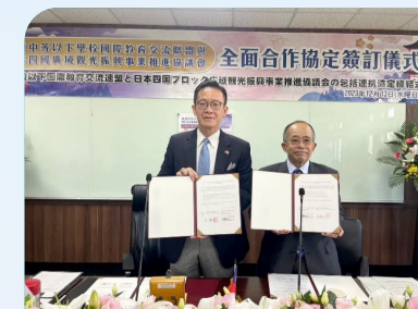
Signing of MOU between the Alliance and Japan Shikoku Tourism Promotion Association.