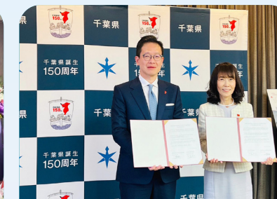
Signing of MOU between the Alliance and Chiba County Board of Education.