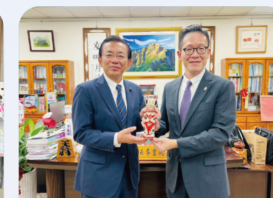
Receiving the Speaker of Council of Miyagi Prefecture, Japan