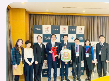
Study tour to Chiba in 2024.