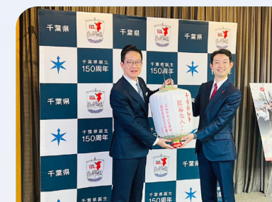
Taking a photograph with the governor of Chiba Prefecture.