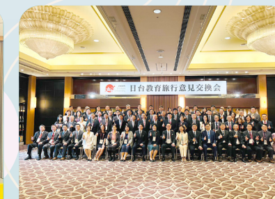
Study tour to Japan