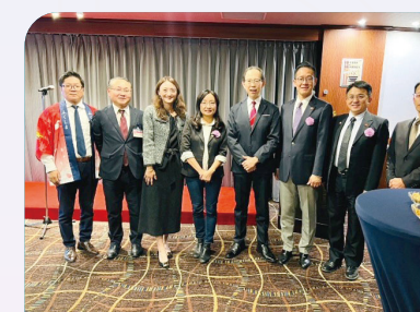
Taking a photograph with the governor of Fukushima-ken Prefecture during the direct flight party of Fukushima-ken.