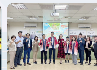
Assisting Fukushima Prefecture, Japan, in organizing a presentation of educational travel.