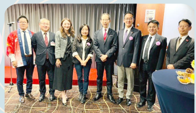
Taking a photograph with the governor of Fukushima-ken Prefecture during the direct flight party of Fukushima-ken.