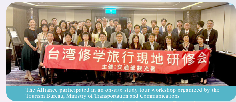
The Alliance participated in an on-site study tour workshop organized by the Tourism Bureau, Ministry of Transportation and Communications