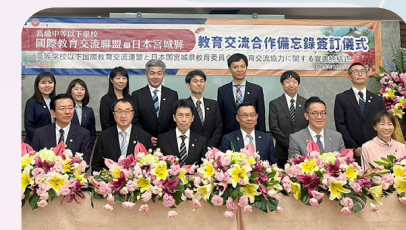
MOE Primary and Secondary School International Educational Exchange Alliance signed a MOU with Miyagi Prefecture.