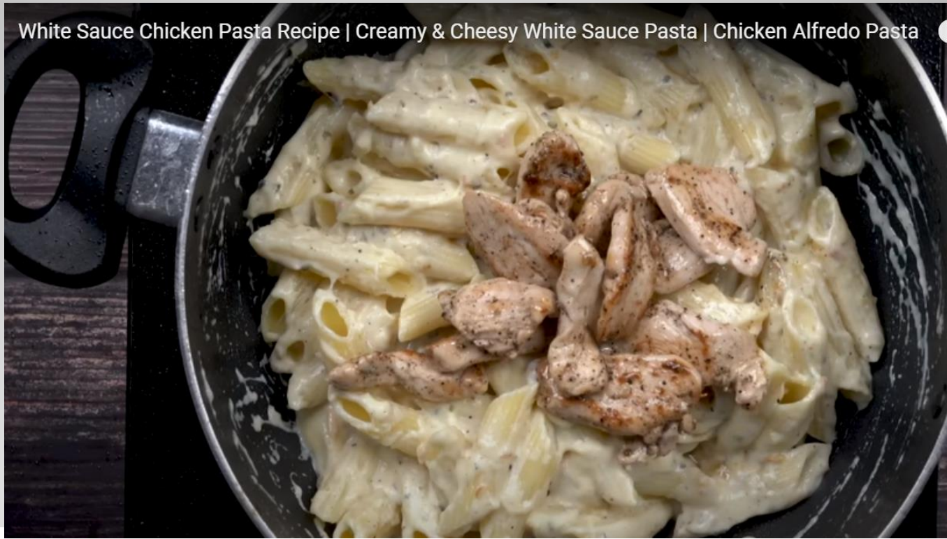
White Sauce Chicken Pasta Recipe | Creamy & Cheesy White Sauce Pasta | Chicken Alfredo Pasta

Sixth, add and stir the cooked pasta and meat.