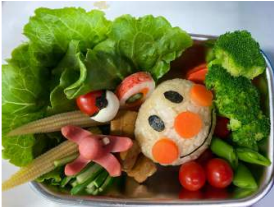
Japanese-style lunch box

What is the difference between a Japanese-style lunch box and a Taiwan-style lunch box?