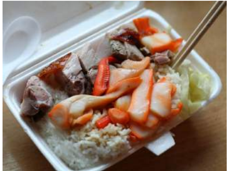
Taiwan-style lunch box