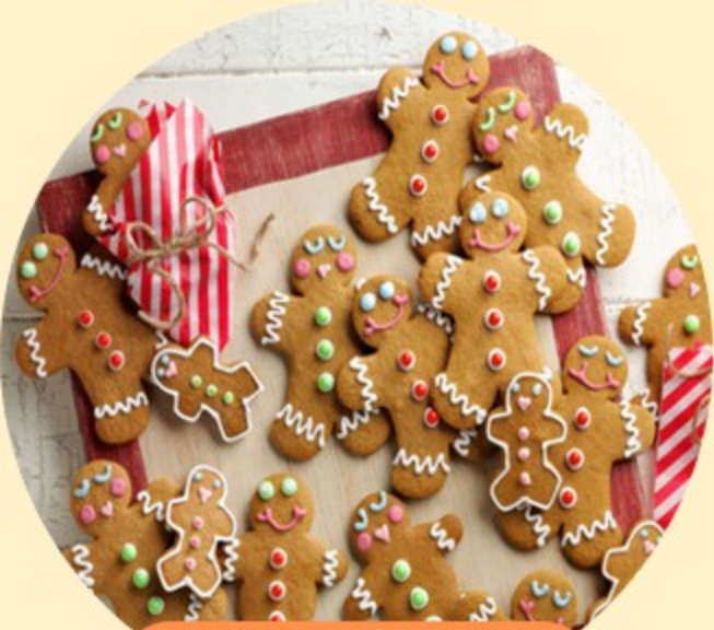
薑餅 Ginger bread