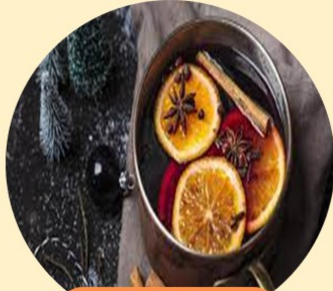
熱紅酒 Mulled wine