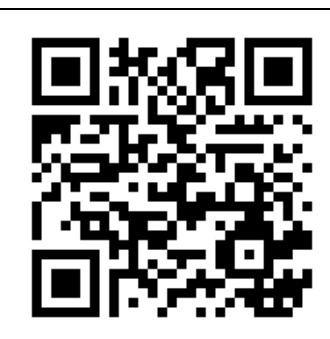
中租-各國綠電 2020 發展現況